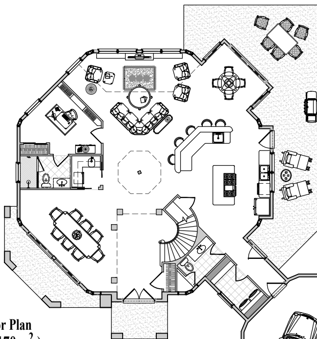
Main Level Floor Plan (1,800 sq. ft. or 170 m 2 )

3 Bedrooms / 3 1/2 Baths Great Room / Study / Dining / Butler's Pantry / Kitchen Breakfast Area / Laundry / Garage ( Total 4,580 sq. ft. or 425 m 2 )