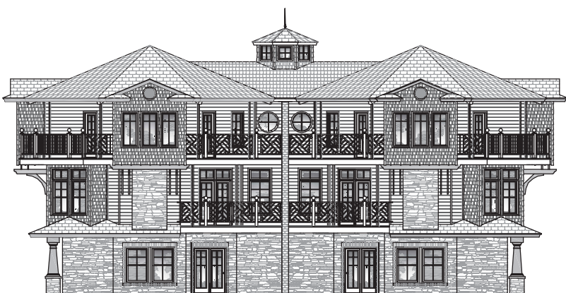
ALTERNATE REAR ELEVATION