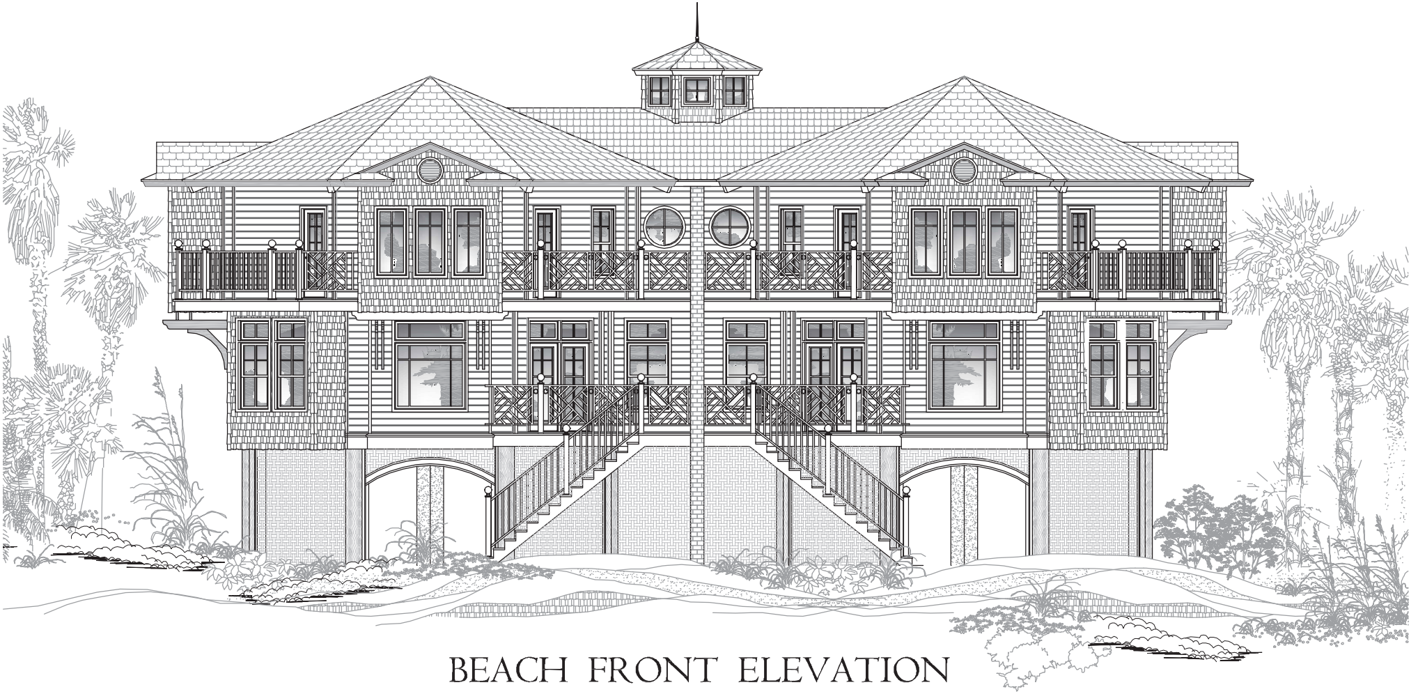
BEACH FRONT ELEVATION