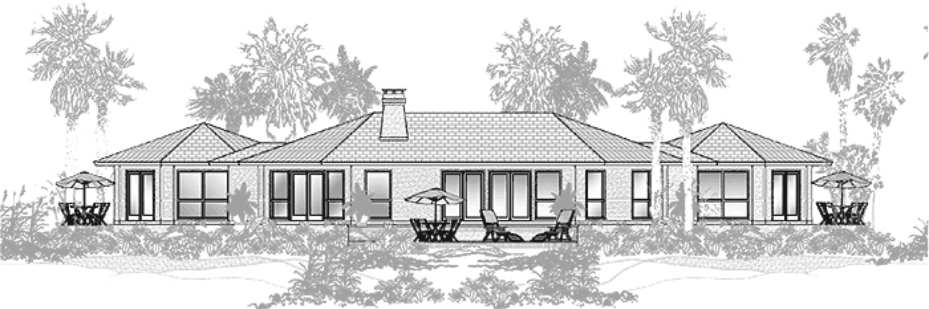
OCEAN FRONT ELEVATION